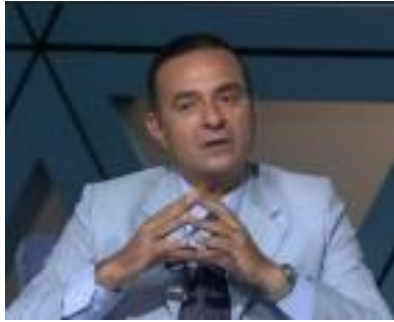
Dr Wafik Noseir

Member of world congress for Environment Egypt